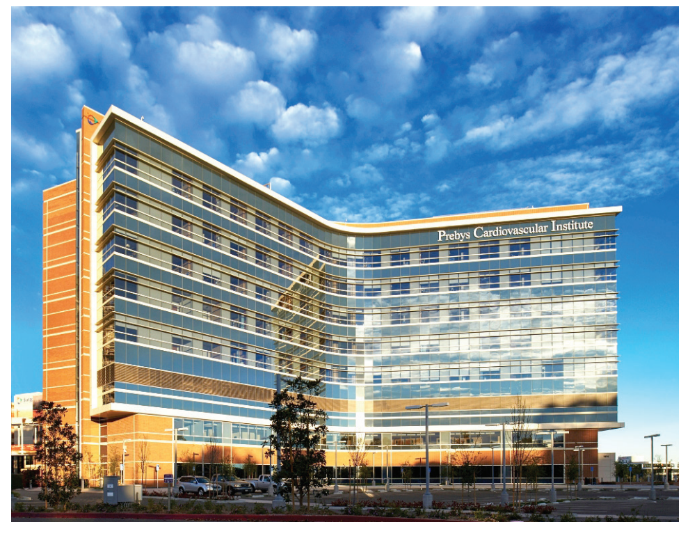
Scripps Memorial Hospital La Jolla